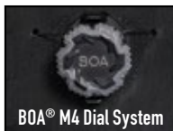
BOA® M4 Dial System