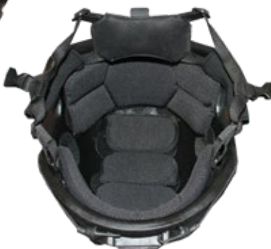
4D Combat Pads System