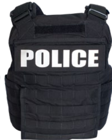
Base Vest Back