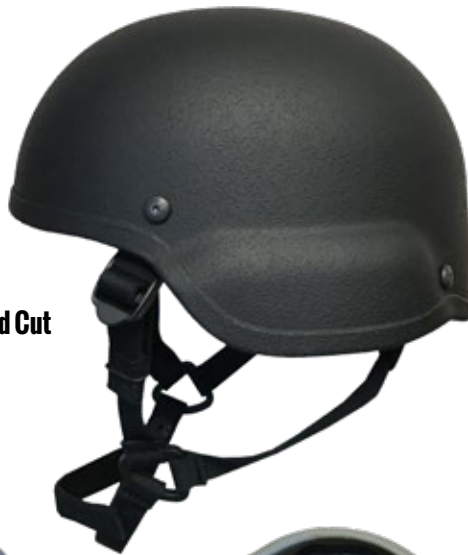
MICH Mid Cut