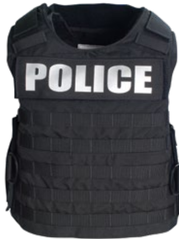
Base Vest Front