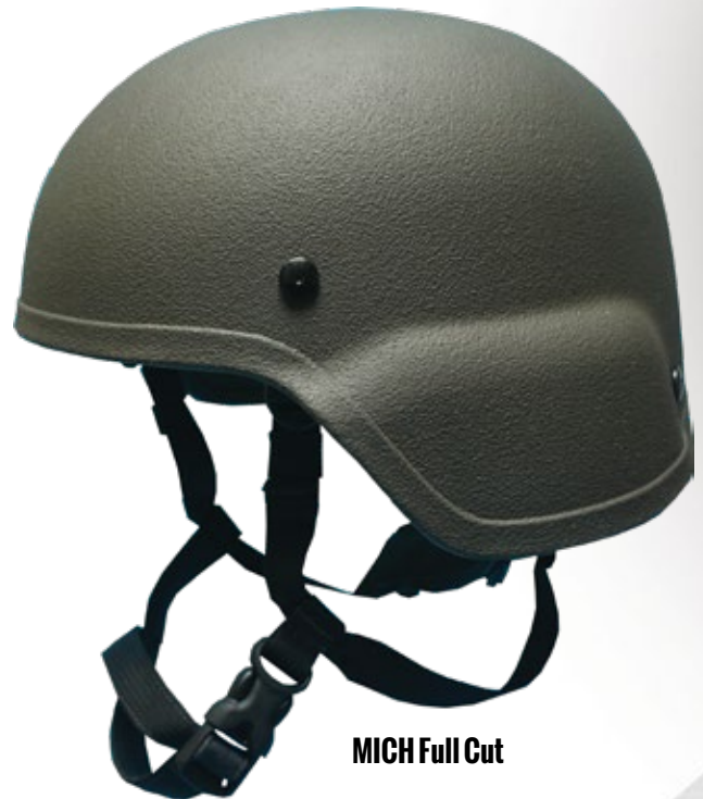
MICH Full Cut