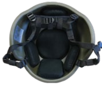
7 Pad System