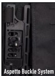
Aspetto Buckle System