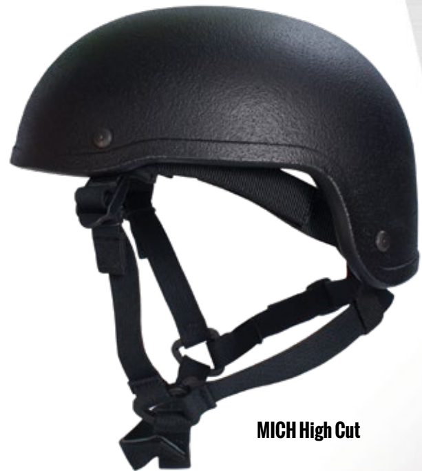
MICH High Cut