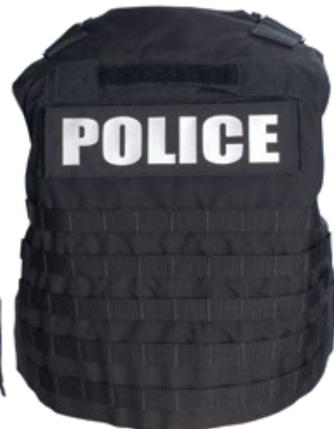
Base Vest Back